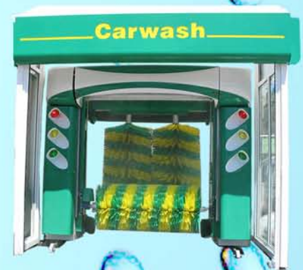
Optional claddings with traffic lights